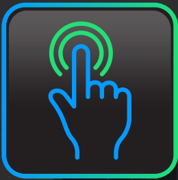
55" Touch Screen